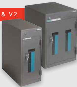
AUTOBANK V1 & V2

The D8 Series line of dispensing safes allow employees to make deposits and get change quickly and easily while documenting every transaction. Units are stand-alone or networkable with built-in CPUs and control panels. Cash is safe and accessible with many anti-theft and time-saving features. The D8C can control up to 15 remote units including the Autobank V1 and V2 bill validators. The D8X delivers dispensing capabilities in a stand-alone unit.