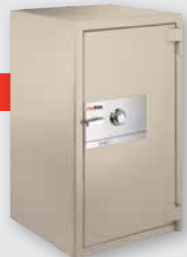
CUSTOM TL-15 MODEL

Burglary and Fire safes are high-security containers which are also fire-rated. Dial combination locks are standard on chest safes, but various upgrade options include electronic combination locks. Underwriter's Laboratories® tests high-security safes to extreme standards. These models feature UL's TL-15 or TL-30 rating for high-security safes. See page 31 for all Burglary and Fire safe models.