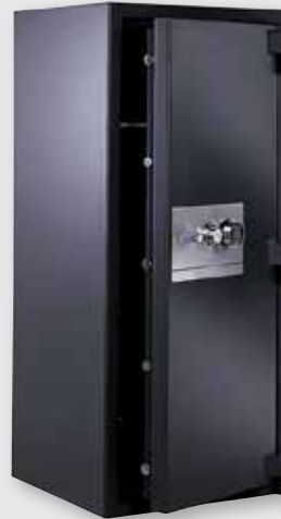
CUSTOM TL-30 MODEL